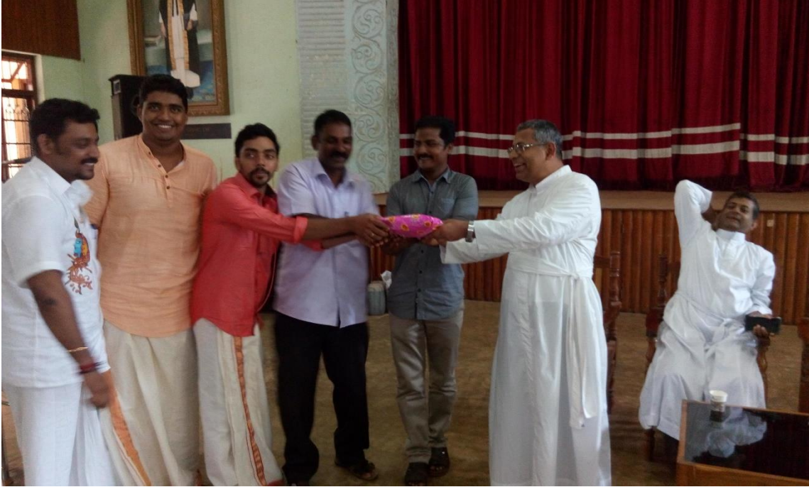
2016-17 Awareness programme for administrative staff