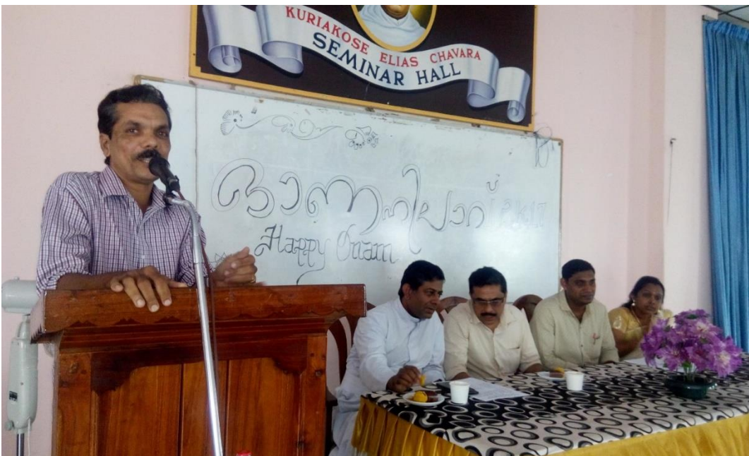
awareness programme for non-teaching staff on 20/08/2018